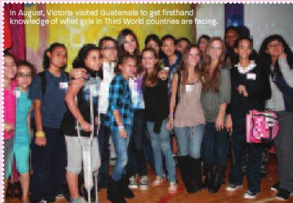
In August, Victoria visited Guatemala to get firsthand knowledge of what girls in Third World countries are facing.

A red-hot romance, two movies on tap and new beats to boot could all be a bit too much for one girl to handle. But Victoria isn't slowing down anytime soon. "Without any risk, there is no reward," she explains. Somehow, knowing Victoria, we're pretty confident she'll end up victorious. ❁